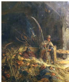
The Morning of Sedgemoor by Edgar Bundy – Tate Britain.

Who from the parish were present at the battle?